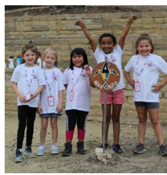
"Heart kids" just being kids

group of 100+ Women Who Care Valley of the Sun. These funds will allow more children with heart conditions to attend camp. They will also help Arizona families by eliminating the financial strains of rising medical costs associated with their child's diagnosis.