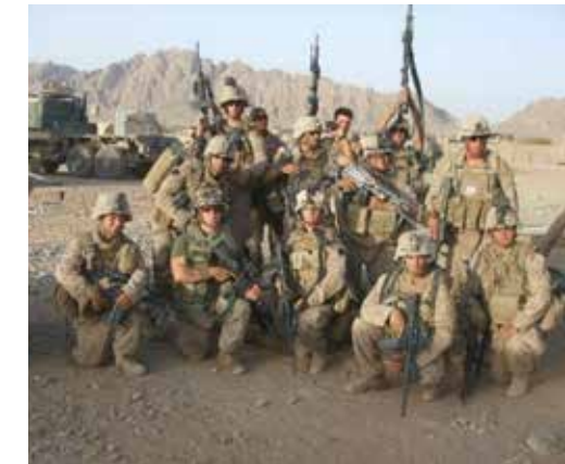
2nd Battalion 7th Marines Fox Company 3rd Platoon.