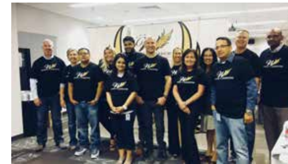
American Express employees helping with hands-on volunteerism.